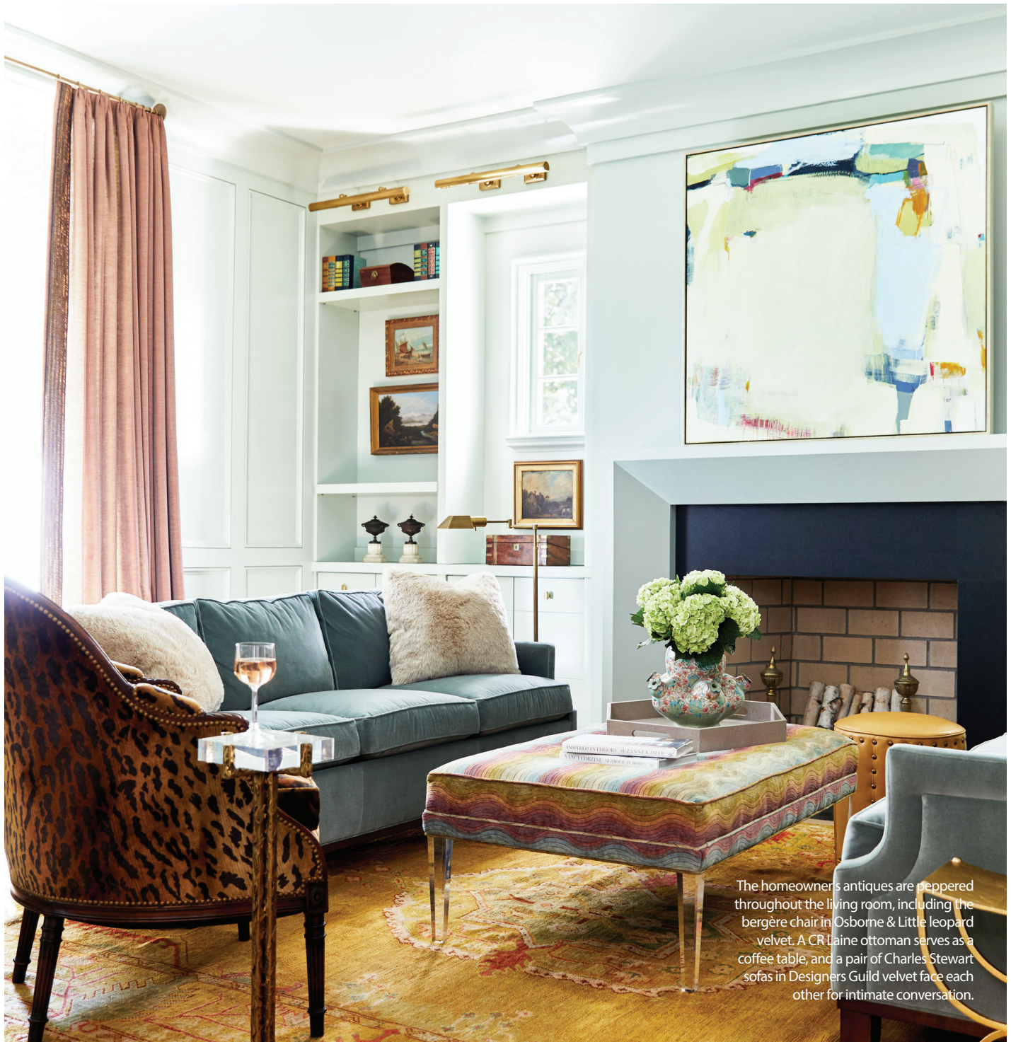
The homeowners' antiques are peppered throughout the living room, including the bergère chair in Osborne & Little leopard velvet. A CR Laine ottoman serves as a coffee table, and a pair of Charles Stewart sofas in Designers Guild velvet face each other for intimate conversation.

“We really wanted our home to be warm and inviting but also elegant and full of the heirlooms I love.” A third-generation native Charlottean, the homeowner had many antique pieces that had been passed down through the years. “I’ve always loved pretty things, from dressing to decorating, and I just wanted that to drip into my home. But in a livable way,” she says.